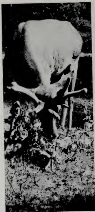
Fig. 6. Red deer stag Jasio. Picture taken on July 25th, 1962

In the growth period 1962 unexpectedly the frontal graft began to grow very intensively. On June 10th, 1962, the approximate length of Jasio's antlers was as follows: operated right 30 cm, operated left 20 cm, parietal graft 3–4 cm, frontal graft 20 cm (Fig. 6).